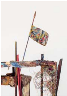
Colorado House , 1962, detail Wood, stretchers, wire, fur, strips of painted canvas, bottles, broom handle, glass shards, flag, photograph, plywood base