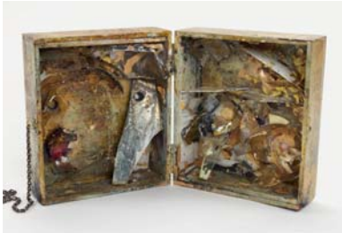
Controlled Burning: For Yvonne Rainer's Ordinary Dance, 1962 Wooden box, glass shards, mirrors, oil paint, burnt