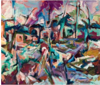
Mill Forms—Eagle Square , 1958 Oil on canvas