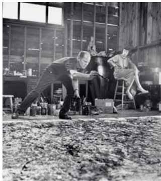
Jackson Pollock and Lee Krasner, 1950