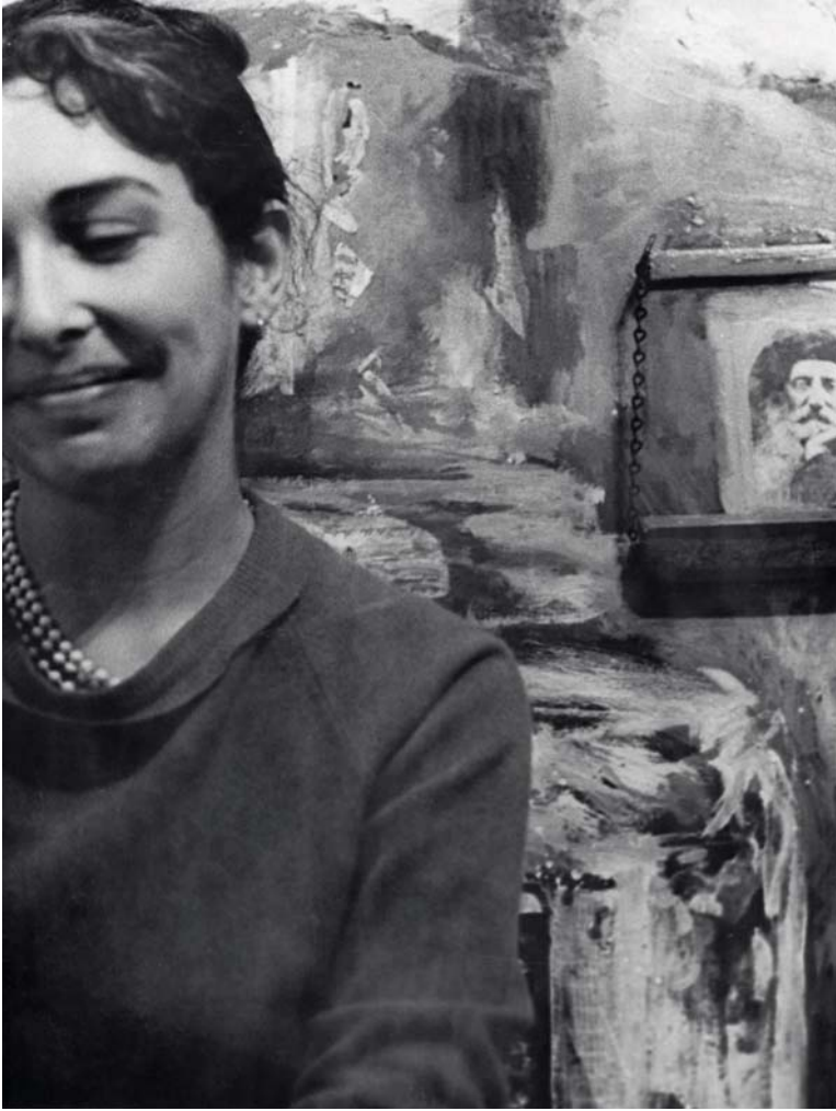
Carolee Schneemann in New York in front of Sir Henry Francis Taylor, 1961